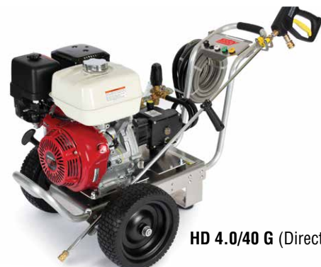
HD 4.0/40 G (Direct)

Low profile handle with cushioned grip is easy to push and pull